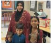
Beautiful family Bangladesh